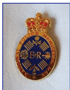
Lapel badges Suggested minimum donation £2.00