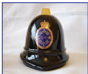
Bone china money boxes Suggested minimum donation £7.50

To assist us to raise funds the following items, bearing the NPMD crest are available:-