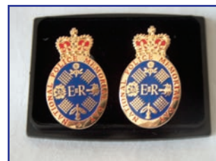
Cufflinks Suggested minimum donation £6.50