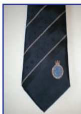
Ties Suggested minimum donation £10.00