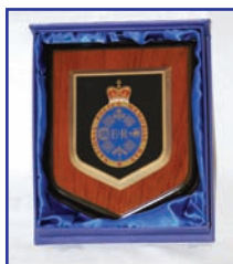
Wall plaques Suggested minimum donation £25.00