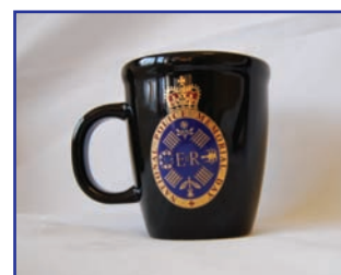
Memorial Mug Suggested minimum donation £3.00

We also have novel collection boxes which we will supply free of charge for individuals and organisations to place in their homes or offices to raise money throughout the year.